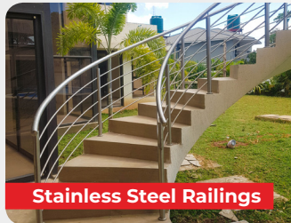
Stainless Steel Railings