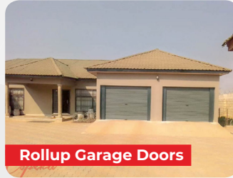
Rollup Garage Doors