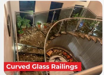
Curved Glass Railings