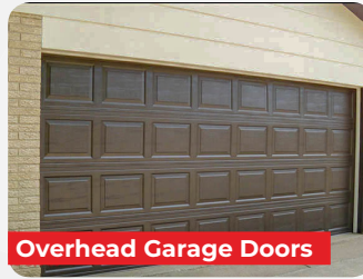
Overhead Garage Doors